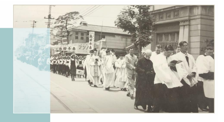
1950 Eucharistic procession in Fukuoka

In the wake of the results produced by the Second Vatican Council, the Diocese of Fukuoka began reforming the liturgy (the mass), and due particularly to the establishment and development of the Lay Apostolate Council, activities engaged in by lay Catholics became increasingly animated. Youth activities flourished throughout the Diocese, and seminars, retreats, and training sessions came to be held frequently.