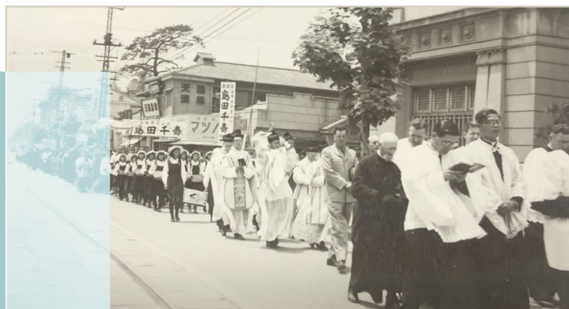
1950 Eucharistic procession in Fukuoka

In the wake of the results produced by the Second Vatican Council, the Diocese of Fukuoka began reforming the liturgy (the mass), and due particularly to the establishment and development of the Lay Apostolate Council, activities engaged in by lay Catholics became increasingly animated. Youth activities flourished throughout the Diocese, and seminars, retreats, and training sessions came to be held frequently.